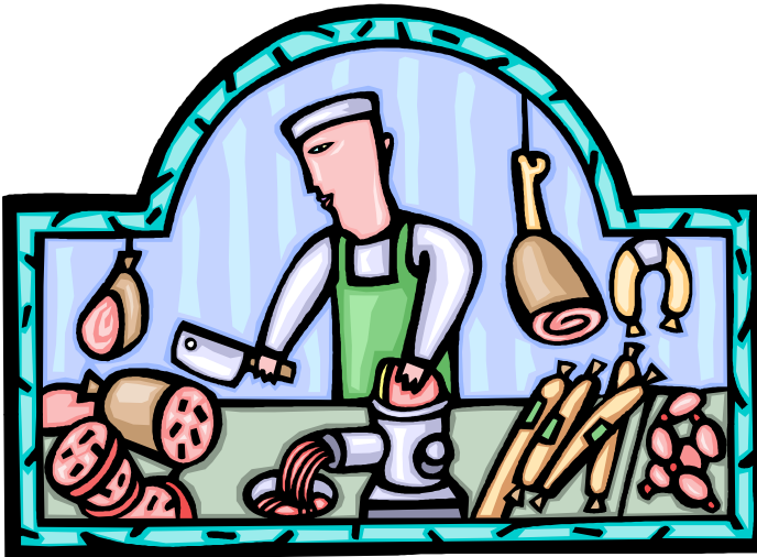
Meat / Deli