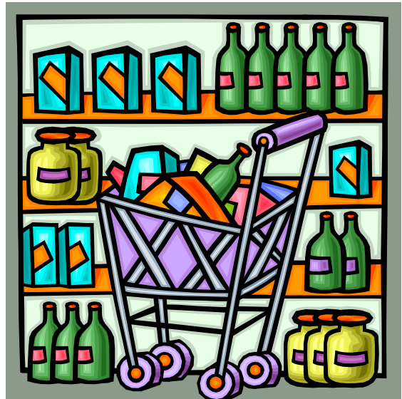
Canned/Boxed Food Aisles