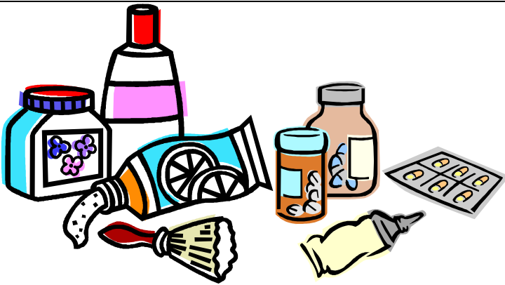
Pharmacy / Health and Beauty