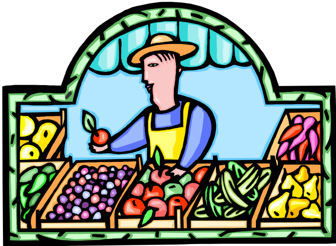
Produce (Fresh Fruits and Vegetables)