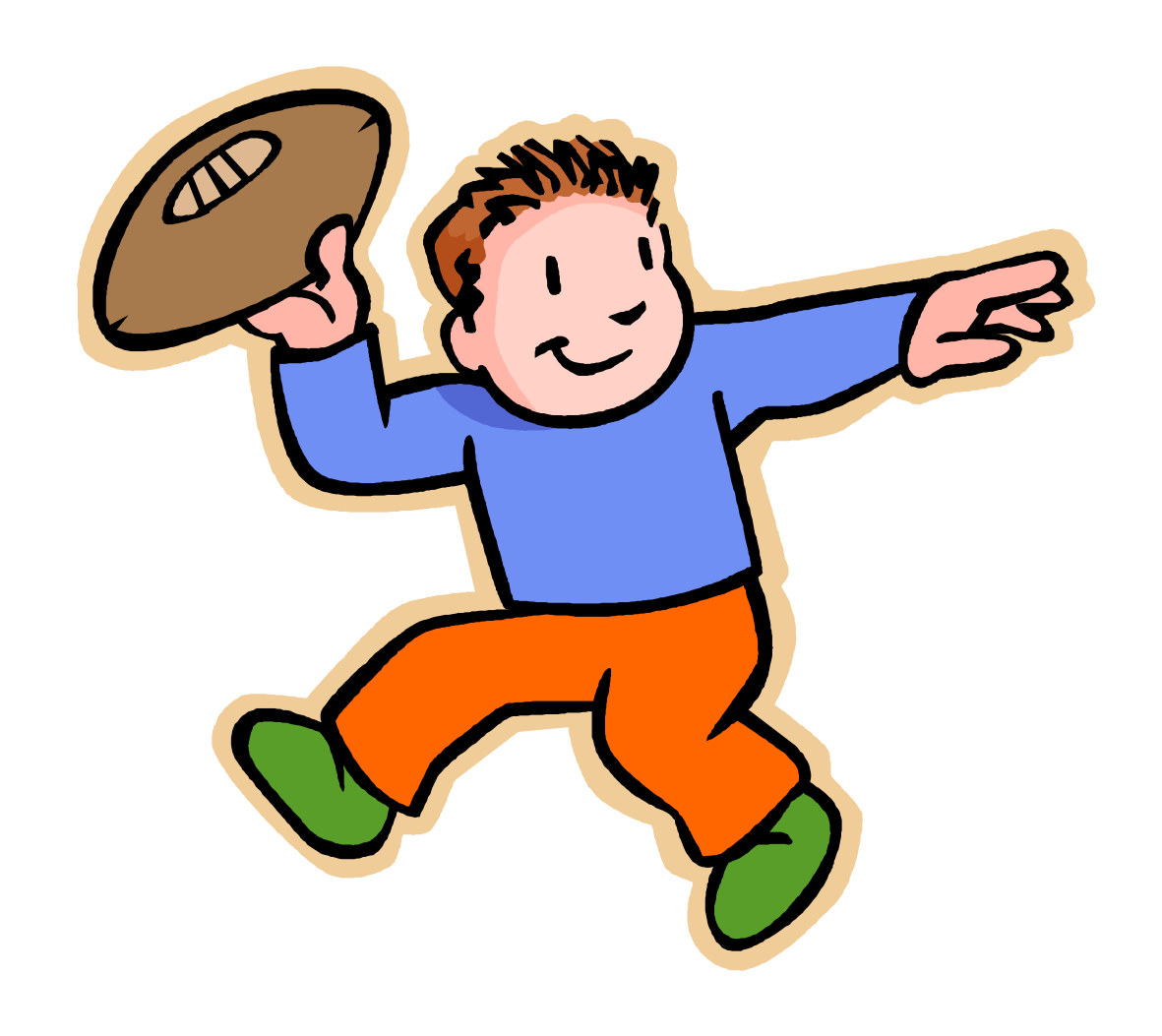
I can throw.