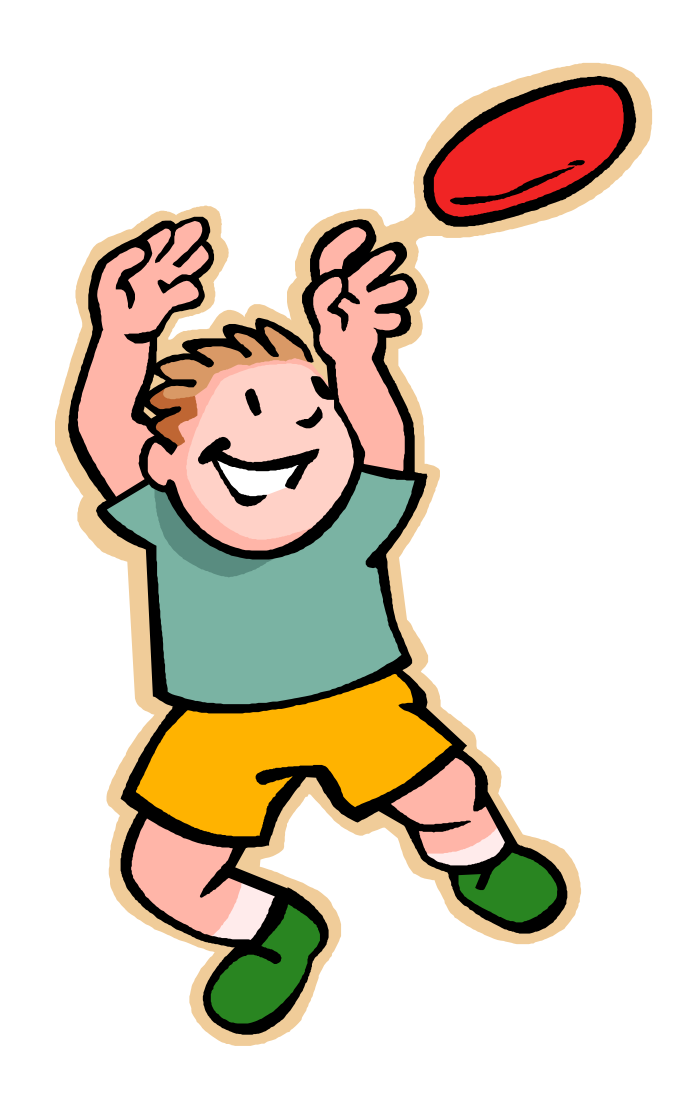
I can catch.