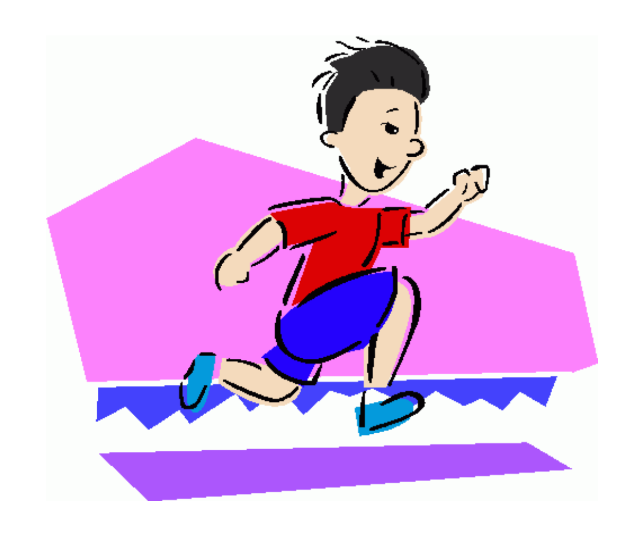
I can run.