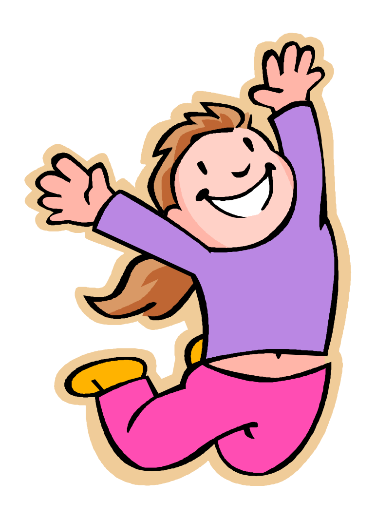
I can jump.