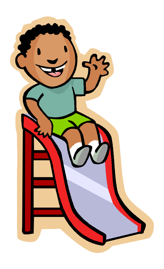
I can slide.